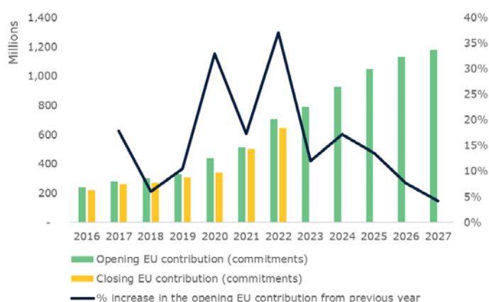
Figure 2 EU contribution to Frontex (2016-2027)

Source: ICF, based EU budget data from MFF 2014-2020 and MFF 2021-27.