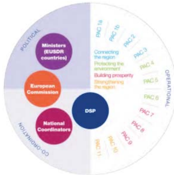
Picture 1: The governance of the EUSDR

c) The revision process started in May 2018. The main steps and the timeline are set out in Annex 1 . The EUSDR Communication (COM 2010a) remains untouched. This means that the principles laid down in the Communication remain entirely valid , including the EUSDR governance and the structure with four Pillars and twelve Priority Areas (see pictures 1 and 2). Still, the Action Plan is considered as a "rolling document", which means that the Danube countries should remain attentive if there is a need for adaption.