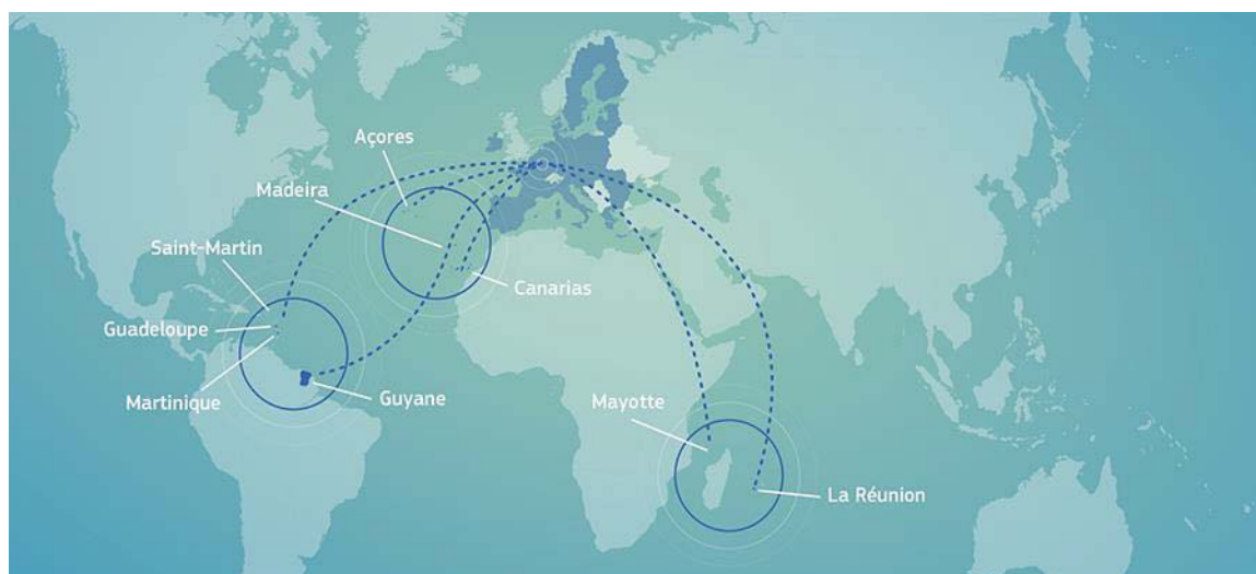
Figure 1: Geographical distribution of EU outermost regions

The special situation of these regions is recognised under Article 349 of the Treaty on the Functioning of the EU (TFEU). This article allows for specific measures for these regions to be taken as it acknowledges that the permanent and combined constraints affect their economic and social situation and severely restrain their development. It permits such measures provided that they do not undermine the integrity and the coherence of the Union legal order, including the internal market and common policies. Such measures concern various policies, including taxation, support to create jobs, boosting competitiveness, and preserving the environment.