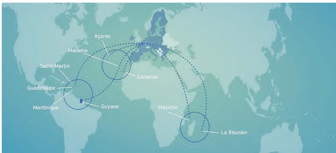
Figure 1: Geographical distribution of EU outermost regions

The special situation of these regions is recognised under Article 349 of the Treaty on the Functioning of the EU (TFEU). This article allows for specific measures for these regions to be taken as it acknowledges that the permanent and combined constraints affect their economic and social situation and severely restrain their development. It permits such measures provided that they do not undermine the integrity and the coherence of the Union legal order, including the internal market and common policies. Such measures concern various policies, including taxation, support to create jobs, boosting competitiveness, and preserving the environment.