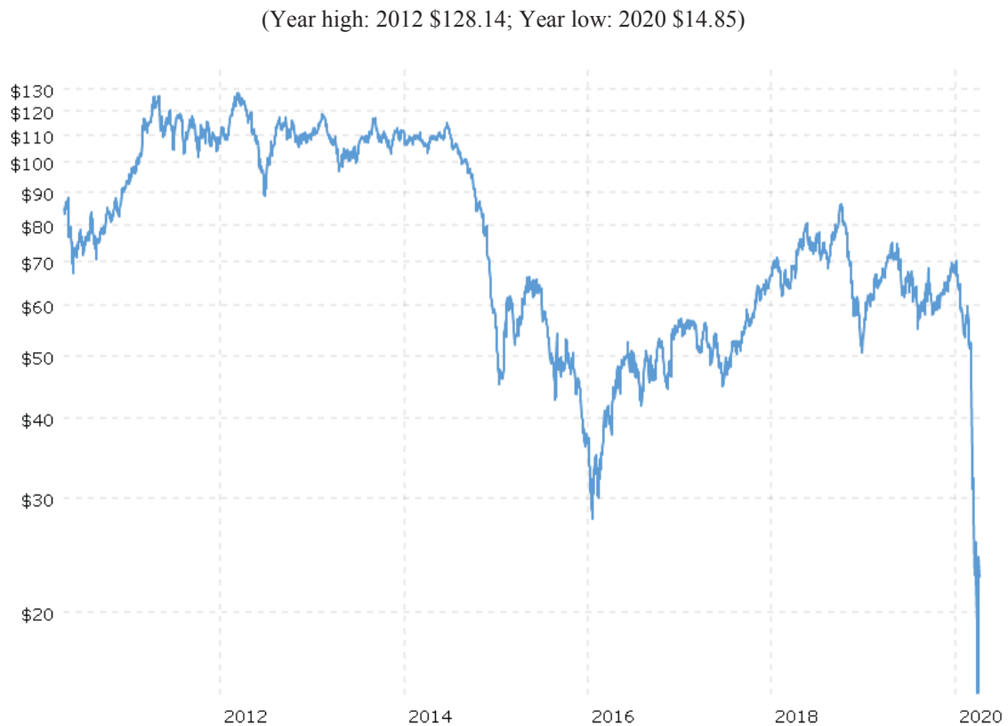
Figure 1: 10-year trend of Brent Crude price (US$/barrel)