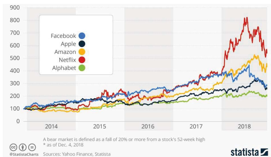
Figure 1 - Stock price development for 5 big tech companies, 2014-2018