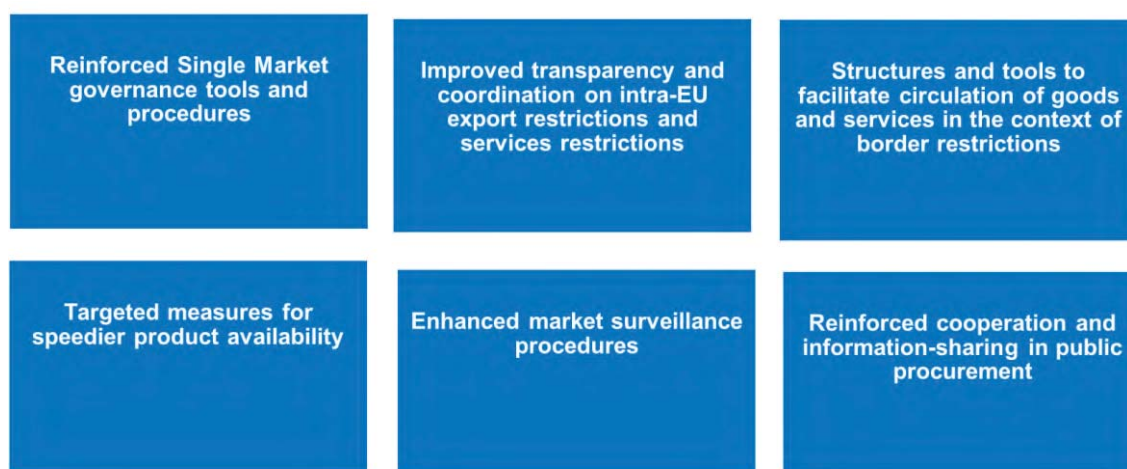
Figure 2 Key elements of the Single Market Emergency Instrument

2021, 16 the Commission will propose a Single Market Emergency Instrument to provide a structural solution to ensure the availability and free movement of persons, goods and services in the context of possible future crises. This instrument should guarantee more information sharing, coordination and solidarity when Member States adopt crisis-related measures. It will help to mitigate the negative impacts on the Single Market, including by ensuring more effective governance. It should also build a mechanism through which Europe can address critical product shortages by speeding up product availability (e.g. standard setting and sharing, fast-track conformity assessment) and reinforcing public procurement cooperation. It will be aligned with relevant policy initiatives such as the forthcoming proposal to establish a European Health Emergency Preparedness and Response Authority (HERA), and the upcoming Contingency Plan for Transport and Mobility as well as relevant international practice aiming at addressing emergency situations or ensuring and speeding up the availability of essential products.