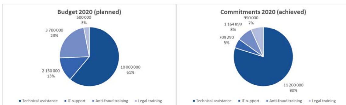
Figure 3: Hercule III budget and commitments in 2020 by type of eligible action

Figure 4 gives an overview of the 2020 budget commitments showing the total amounts and number of grants awarded by Member State for technical assistance, anti-fraud training and legal training. Grants were awarded to applicants from 17 Member States.