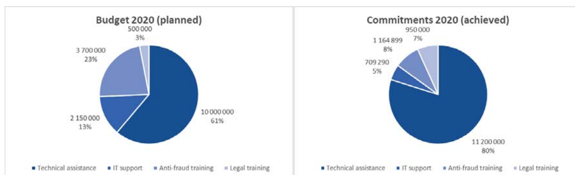
Figure 3: Hercule III budget and commitments in 2020 by type of eligible action

Figure 4 gives an overview of the 2020 budget commitments showing the total amounts and number of grants awarded by Member State for technical assistance, anti-fraud training and legal training. Grants were awarded to applicants from 17 Member States.