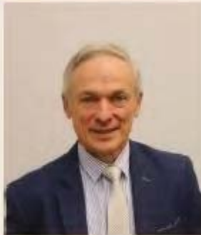
Richard Bruton TD Fine Gael