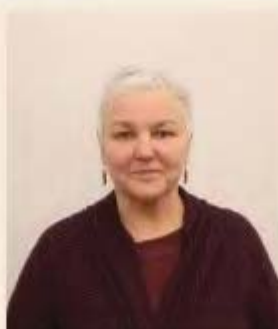
Brid Smith TD