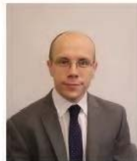
Darren O'Rourke TD Sinn Féin