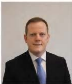
Alan Farrell TD Fine Gael