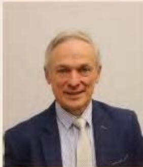
Richard Bruton TD Fine Gael