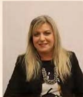
Réada Cronin Sinn Féin