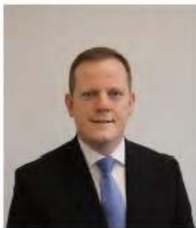
Alan Farrell TD Fine Gael