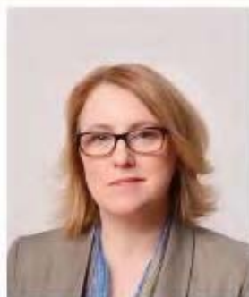
Senator Alice-Mary Higgins Independent