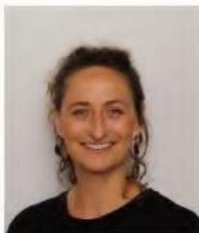
Senator Lynn Boylan Sinn Féin