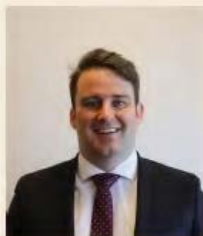
Senator John McGahon Fine Gael