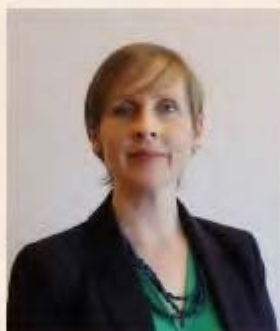
Senator Pauline O'Reilly Green Party