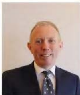
Senator Timmy Dooley Fianna Fáil