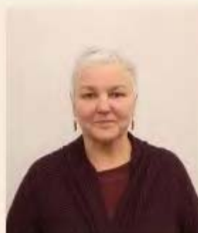
Brid Smith TD