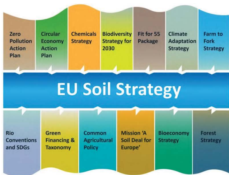
Figure 1: links between the EU Soil Strategy and other EU initiatives

To reap the benefits of healthy soils for people, food, nature and climate, the EU needs a renewed Soil Strategy that sets out a framework and concrete measures for protecting, restoring and sustainably using soils and that mobilises the necessary societal engagement and financial resources, shared knowledge, sustainable practices and monitoring to reach common objectives. The strategy is closely linked and works in synergy with the other EU policies stemming from the European Green Deal and will underpin our ambition for global action on soil at international level. This will only be achieved through a combination of new voluntary and legally binding measures, presented here below, developed in full respect of subsidiarity and building on existing national soil policies.