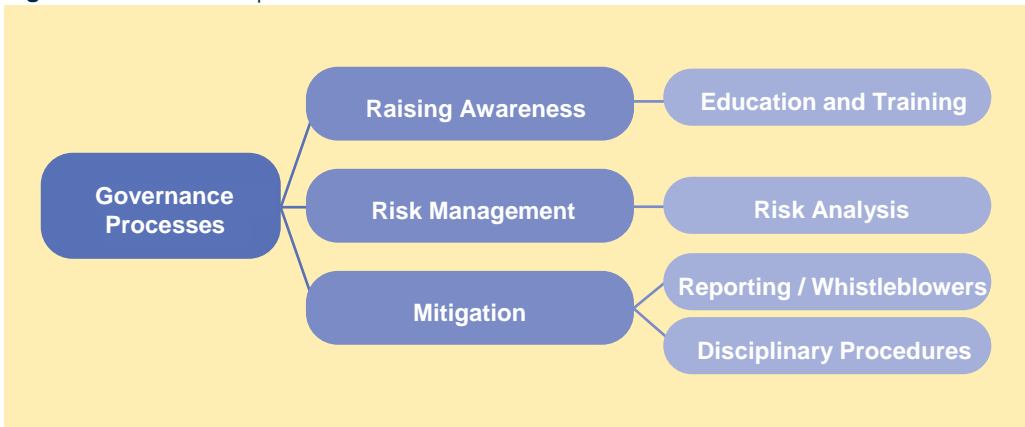
Figure 3.2: Governance processes

The Committee will manage the identification of risks and mitigation measures. These will include those risks that concern core values, international partnerships and security (both infrastructure and cybersecurity). However, these risk studies should only be carried out when the countries involved do pose a potential hazard (see also Chapter 2 and 4 for details). The details of foreign interference for these are detailed in the relevant sections of this document. The Committee will oversee measures to raise awareness of potential threats from foreign interference among staff and students. This will be achieved through education and training as the proactive participation of staff and students will be a core component of identifying risks. This importance of awareness raising and training has already been stressed in the previous chapter on Values. The Committee will provide guidance and oversee measures to ensure smart management of intellectual assets and compliance with intellectual property rules in international cooperations. The FI Committee will also be responsible for investigating cases of potential foreign interference. This may require external expert input especially when dealing with cases of institutional foreign interference. In instances it may be necessary to impose disciplinary procedures, but the focus will be identifying and avoiding potential foreign interference. When assessing risk, it is important that FI Committee safeguards academic freedom.