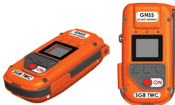
Figure 2: Mechanical design of a SGB TWC beacon prototype

19 The TWC service shall allow sending “1-way” instructions ‘how-to-react’ from SAR forces to beacon users.