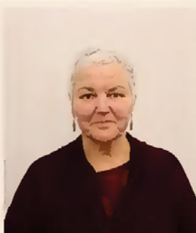
Brid Smith TD