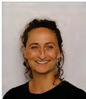
Senator Lynn Boylan Sinn Féin