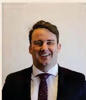
Senator John McGahon Fine Gael