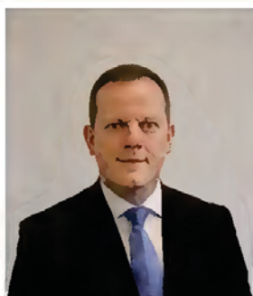
Alan Farrell TD Fine Gael