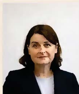
Jennifer Whitmore TD