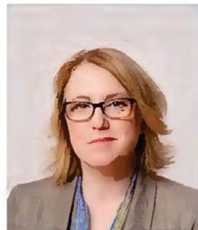
Senator Alice-Mary Higgins Independent