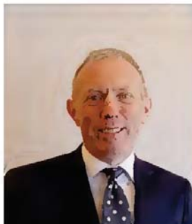
Senator Timmy Dooley Fianna Fáil