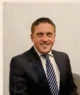
Cormac Devlin TD Fianna Fáil