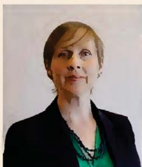
Senator Pauline O'Reilly Green Party