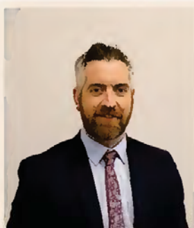
Christopher O'Sullivan TD