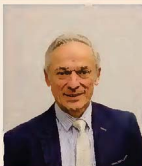
Richard Bruton TD Fine Gael