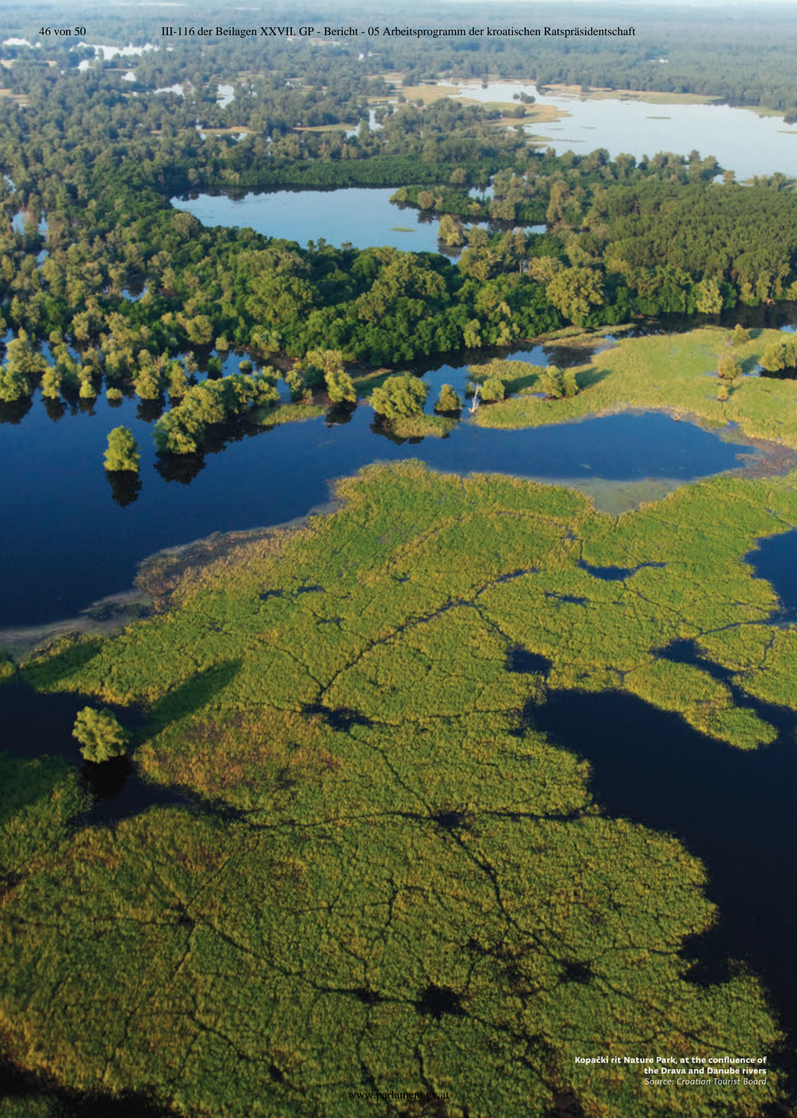
Kopački rit Nature Park, at the confluence of the Drava and Danube rivers