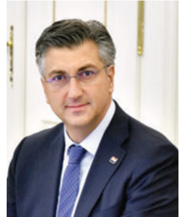
Andrej Plenković Prime Minister of Croatia

From 1 January to 30 June 2020, Croatia will take over the Presidency of the Council of the European Union for the first time. During this six-month period, Croatia will lead the activities of the Council as an honest broker, building cooperation and agreement among Member States in a spirit of consensus and mutual respect.