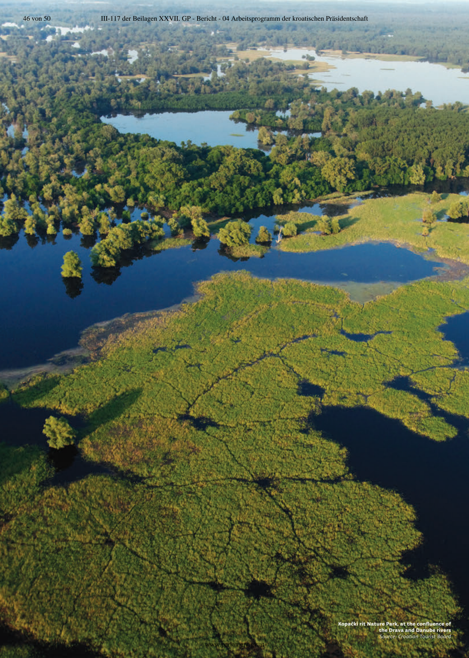
Kopački rit Nature Park, at the confluence of the Drava and Danube rivers