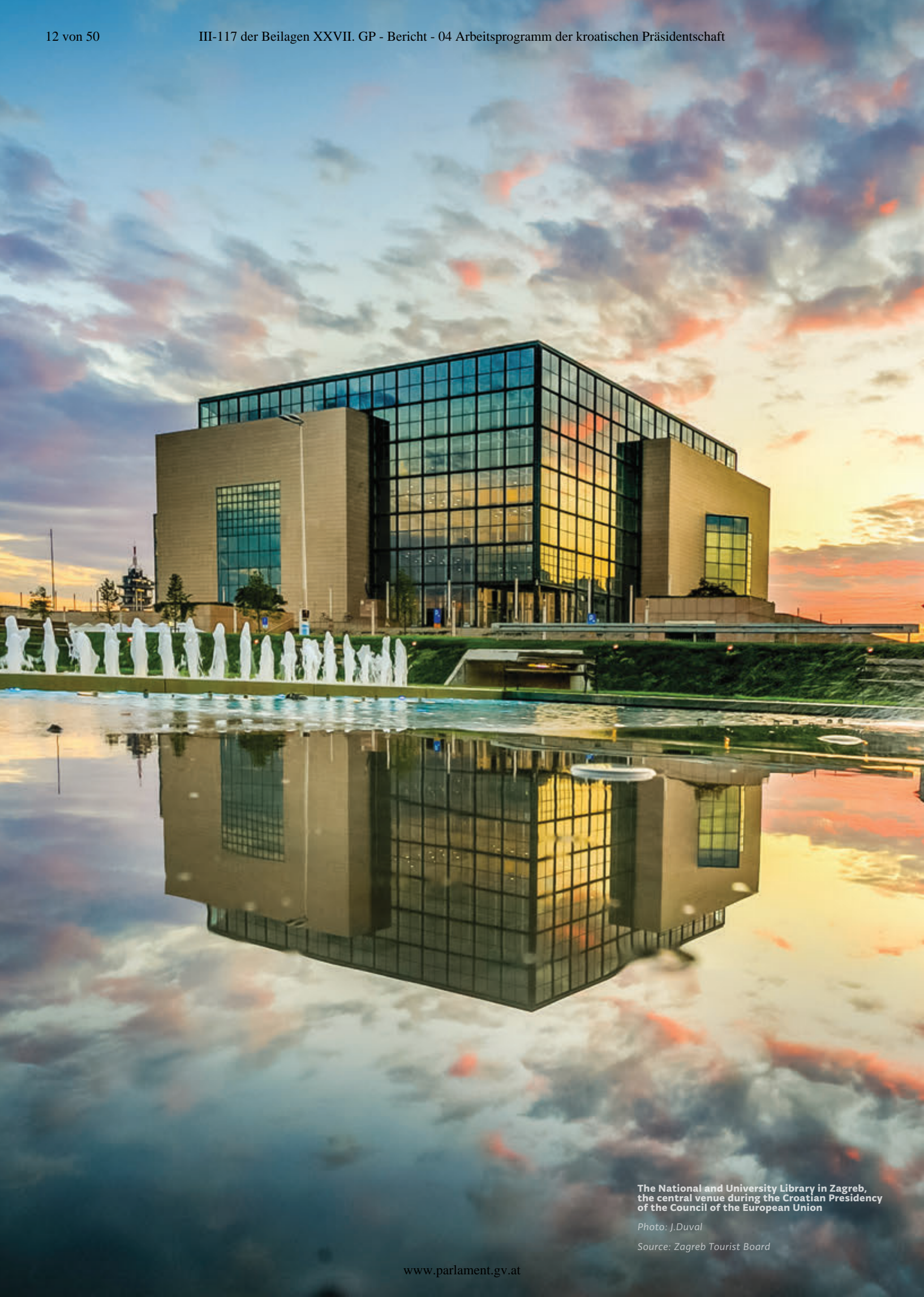
The National and University Library in Zagreb, the central venue during the Croatian Presidency of the Council of the European Union