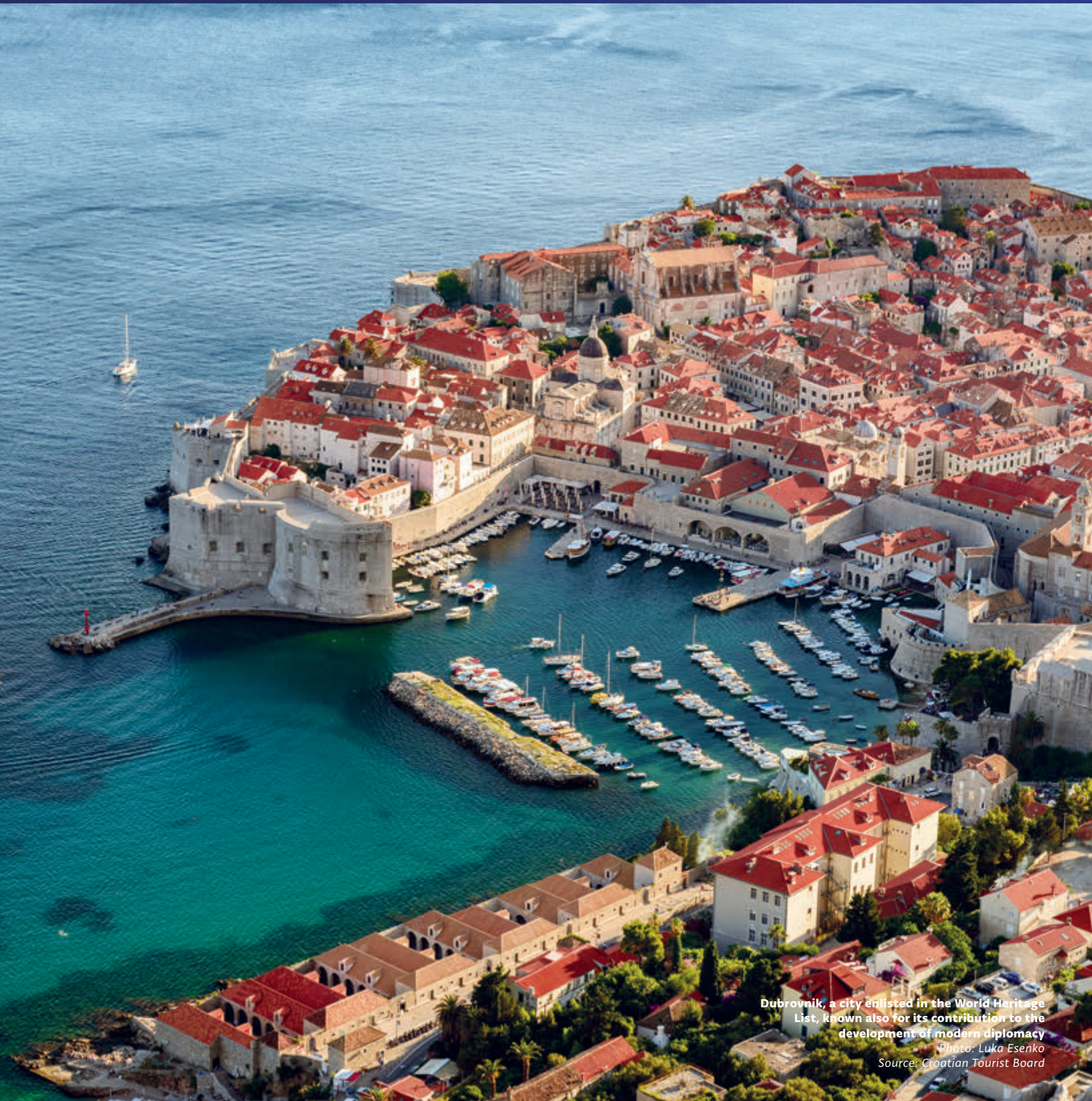
Dubrovnik, a city enlisted in the World Heritage List, known also for its contribution to the development of modern diplomacy