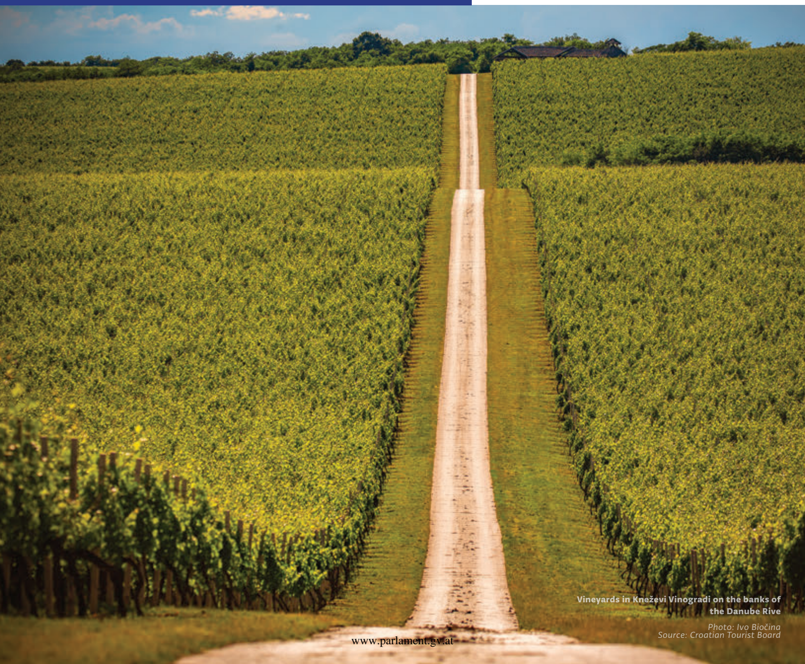
Vineyards in Kneževi Vinogradi on the banks of the Danube River

Croatian Presidency of the Council of the European Union