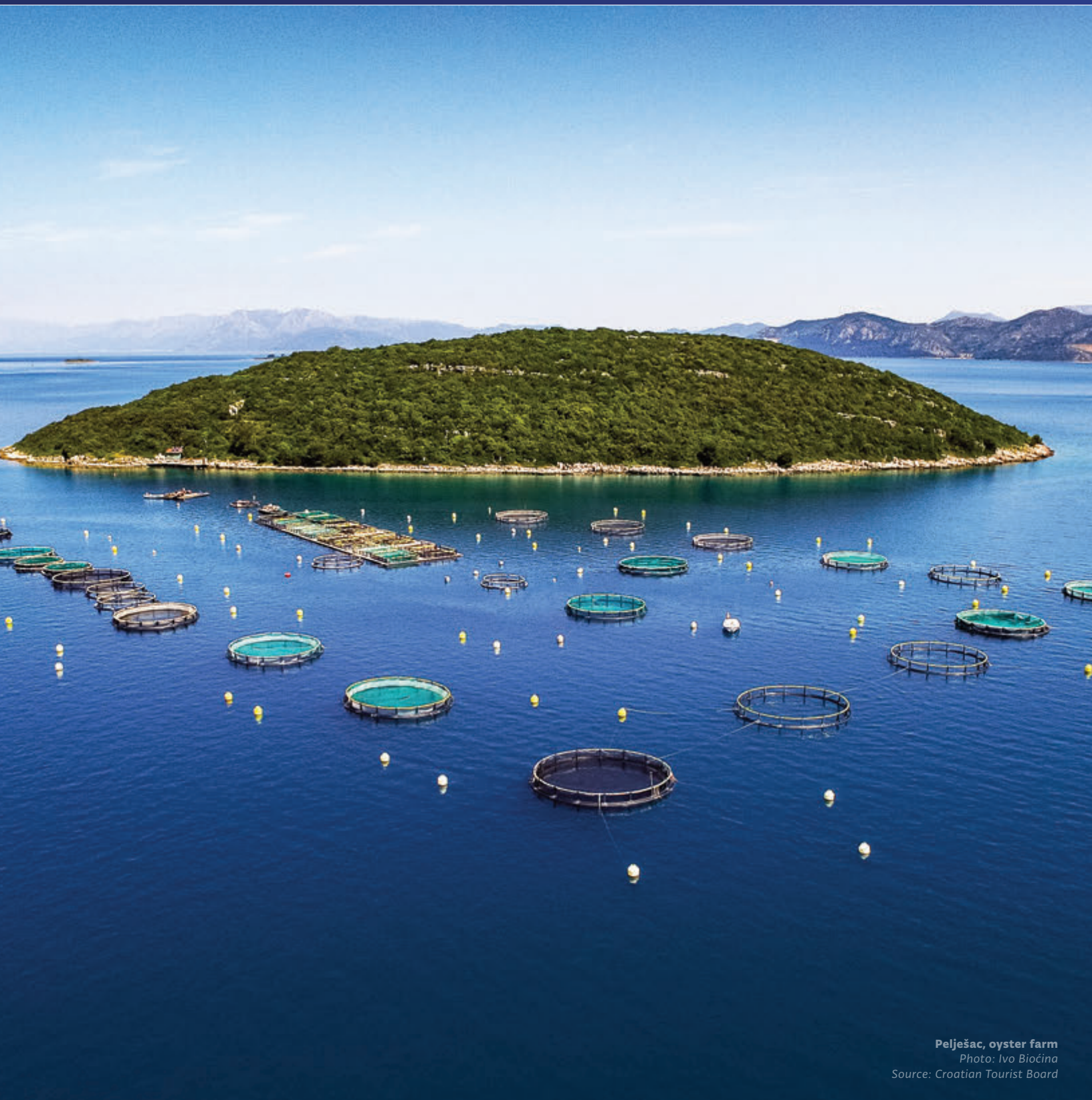
Pelješac, oyster farm