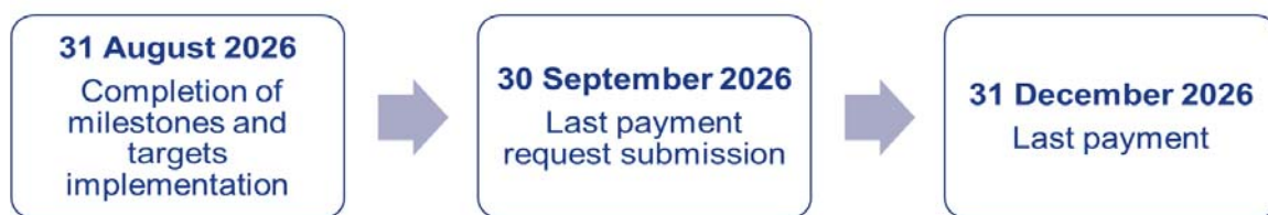
Figure 3: Timeline of the RRF closure