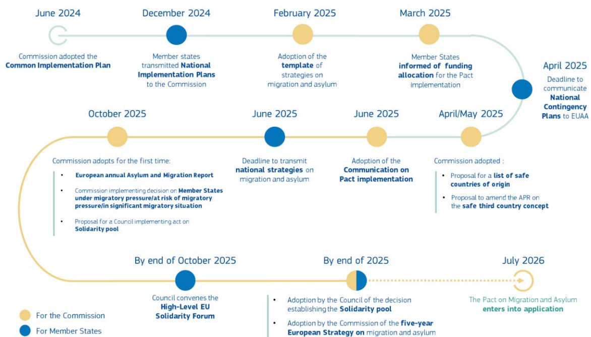
Figure 1: Timeline of the transition period

With this Communication, the Commission informs the European Parliament and the Council on the implementation of the Pact, in accordance with Article 84 of the Asylum and Migration Management Regulation (5) . Building on the key actions of the Common Implementation Plan of June 2024 and in anticipation of the launch of the first annual solidarity cycle in October 2025, this Communication presents a state of play of the progress made at EU and national level on the implementation of the Pact and provides an overview of the state of implementation in relation to each of the ten building blocks. As a next step, the Annual Report on Migration and Asylum of October 2025 will include an updated state of play of the implementation of the Pact. The Commission will then present a long-term European Asylum and Migration Management Strategy by the end of this year to support an integrated and coordinated approach to the implementation of the Pact, both at EU and national level.