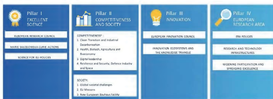
Figure 1 – The structure of the new Horizon Europe

1 Consistent with activities under the European Competitiveness Fund