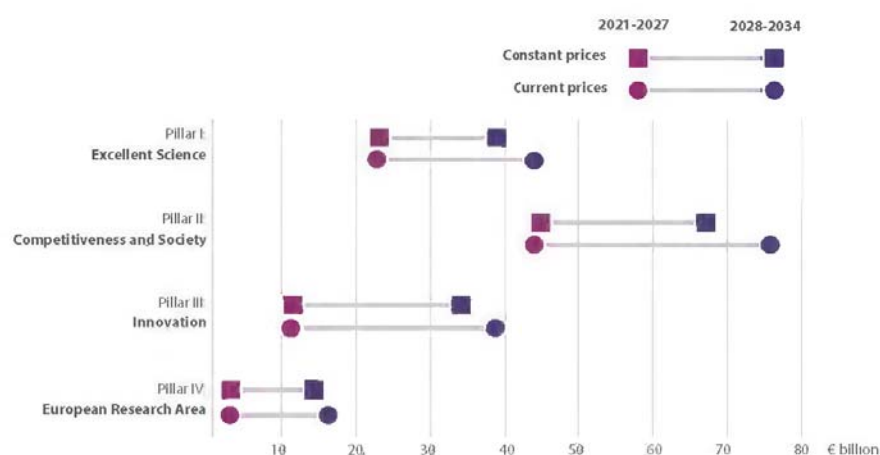
Figure 2 – Horizon Europe budget allocation 2021-2027 vs. 2028-2034

Note: The figure is expressed in current and constant (2025) prices. While Pillar IV is new, the ERA has been covered by other budget areas under FP9 and previous framework programmes.