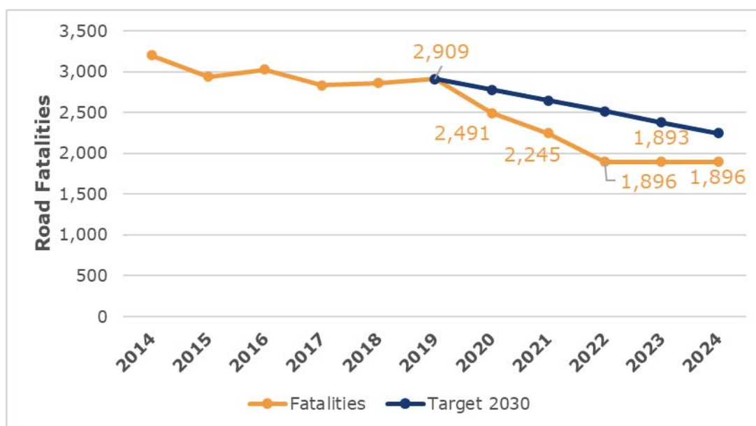
Figure 22.2 Road fatalities and target 2030 2

Compared to 2019, a decrease of 35% in road fatalities was recorded in 2024. Also, the number of serious injuries fell significantly, recording a decrease of 27% between 2019 and 2024. Thus, Poland is well on track to meet the 2030 targets of halving the numbers of fatalities and serious injuries .