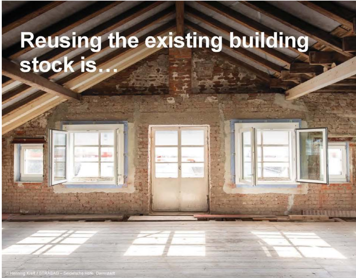
© Henning Krell / STRABAG – Seidelsche Höfe, Darmstadt