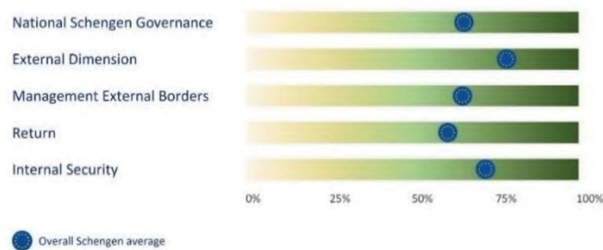
Aggregated Scoreboard of December 2025

The 2025 Schengen Scoreboard (60) paints a diverse picture of how Member States contribute to the functioning of the Schengen area: